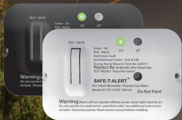
Alarm without trim ring

85-741 Surface Mount Models: 85-741-BL (Black) 85-741-WT (White)