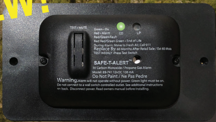
Alarm with trim ring